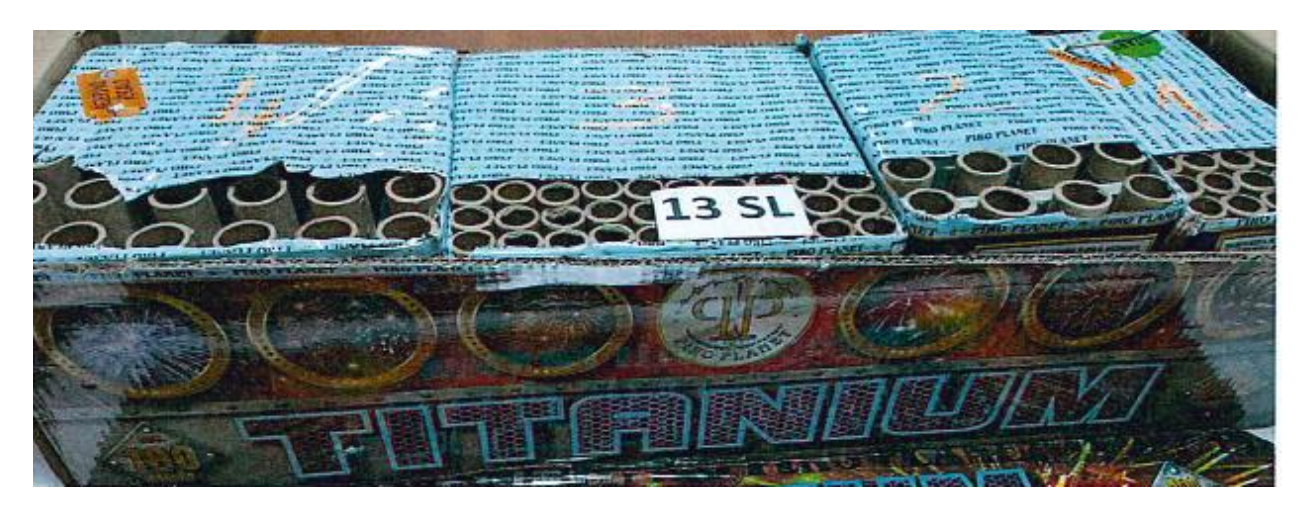
Figure 1 - Product 13SL - An example of a compound firework

An example of a 'compound firework' is shown at Figure 1. It consisted of a number of batteries which are securely fixed on the same base and connected together by a linking and a reserve fuse.