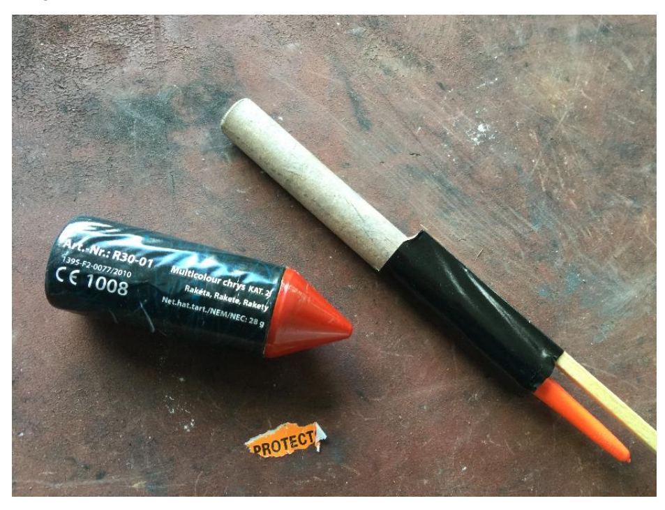
Figure 9 - Rocket in which the plastic fuse cover precluded access to the fuse and in which the head of the rocket became detached when the lab staff attempted to remove the fuse cover.

Further evidence of this lack of attention to quality control was provided by a rocket, which was tested by the selected laboratory. In most of the samples it was not possible to remove the orange plastic cover of the fuse. When the laboratory tried to remove the cover the head of the rocket became detached. The laboratory concluded that the manufacturer used a mechanical method to put the plastic covers onto the rocket and that this would present a problem to the consumer when trying to light the fuse. Clearly this issue was not picked up during the inspection process. A photograph showing the rocket and its plastic fuse cover is at Figure 9.