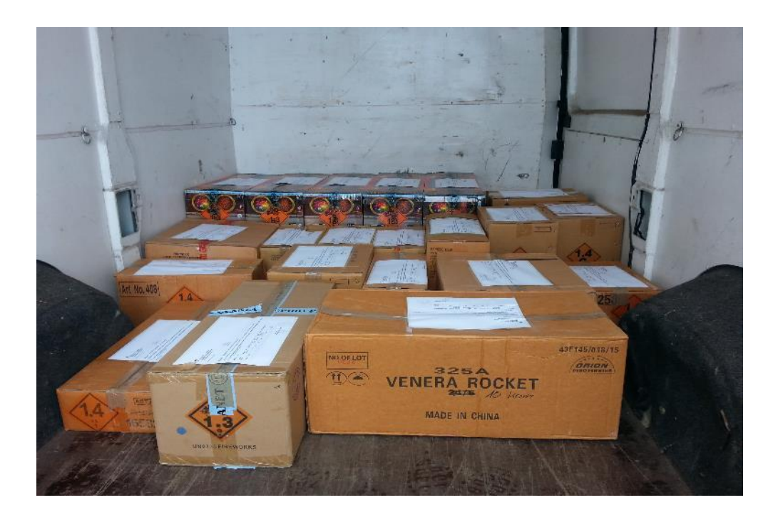
Figure 2 - Fireworks collected during the 2016/17 by Slovenia

The fireworks in Figure 2 - Fireworks collected during the 2016/17 by Slovenia are packaged and labelled appropriately prior to being transported to one of the laboratories for testing.