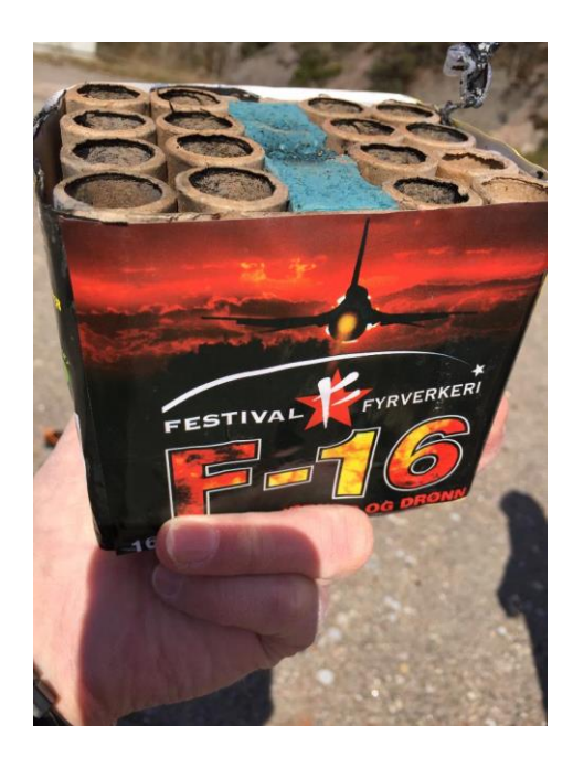
Figure 3 - Product collected by the Norway - all the shots failed to fire correctly.

Figures 3 - 8 show a battery and a compound firework in which the non-conformity related to the incomplete firing of a number of tubes.