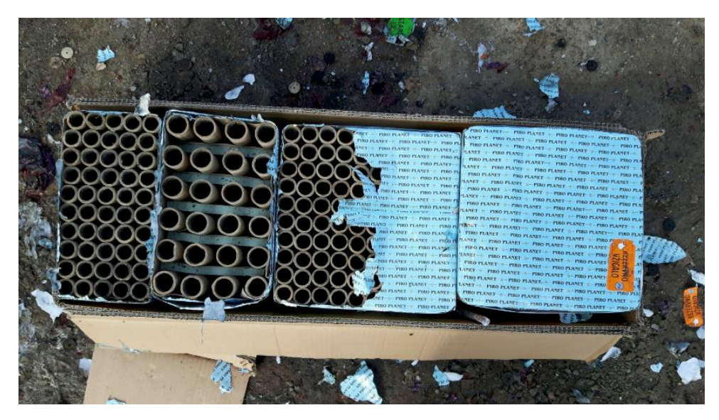
Figure 4 - A further example of samples SL 13 showing the parts that failed to fire.

This was a major non-conformity with regard to EN 15947-5: 2010 - Clause 7.2.2 - Functioning.