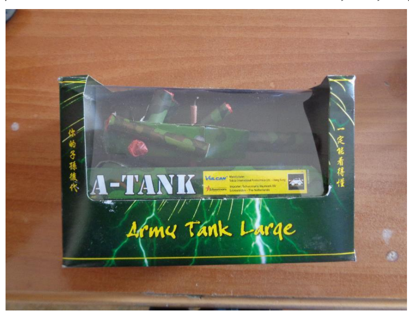
Figure 8 - Sample BE 116 in its box. Many consumers would think this is a toy rather than a firework.

Figures 7 and 8 show Sample BE 116 - which is boxed to look like a toy tank, but which is actually a Category F2 firework of the type 'Ground Mover'. When ignited the firework moved along the ground for a distance of circa 5m. One of the 10 samples failed to ignite because of a faulty fuse. In this case the product may then have been used indoors as a toy tank, thereby creating a domestic fire hazard.