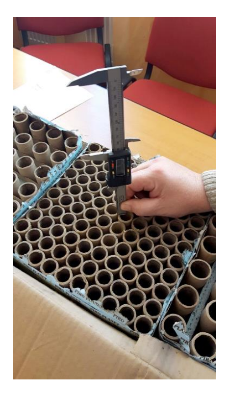
Figure 6 - Sample SL 13 - Compound firework in which this part of the firework failed to fire correctly.