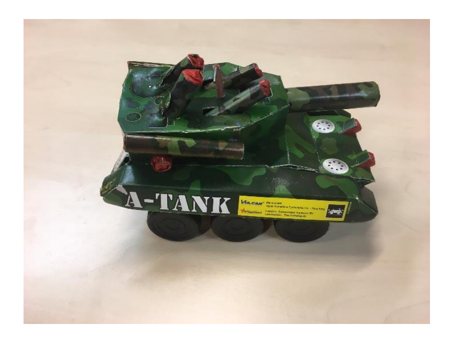
Figure 7 - Shows sample BE 116 - A Ground Mover which has been modelled in the form of a toy, in this case a tank