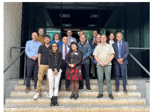
Figure 2 Group Picture from the mutual visit in Italy