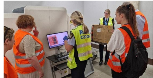
Figure 1 Customs checks from the mutual visit in Latvia

Funded by the European Union. Views and opinions expressed are however those of the author(s) only and do not necessarily reflect those of the European Union or the European Innovation Council and SMEs Executive Agency (EISMEA). Neither the European Union nor the granting authority can be held responsible for them.